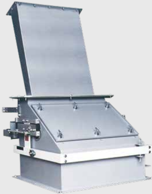
DLM Solids flow meter