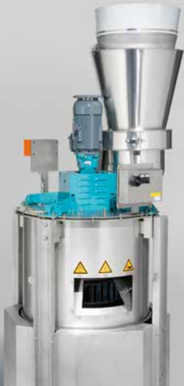
MULTICOR® S Mass flow meter

Schenck Process offers dry material feeders for every feeding application. Volumetric, gravimetric, vibratory, single or twin screws are all available technologies. Feed rates as low as 500 grams per hour and as high as 1,100 cubic feet per hour are possible.