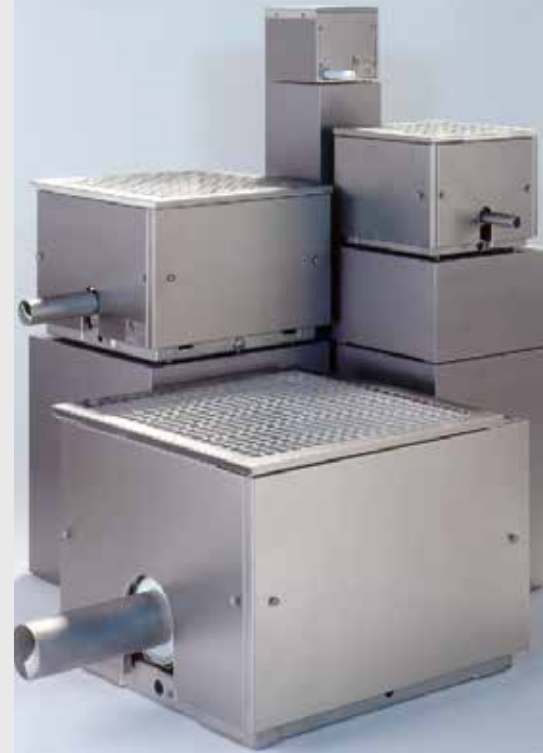
AccuRate® series Volumetric feeding systems